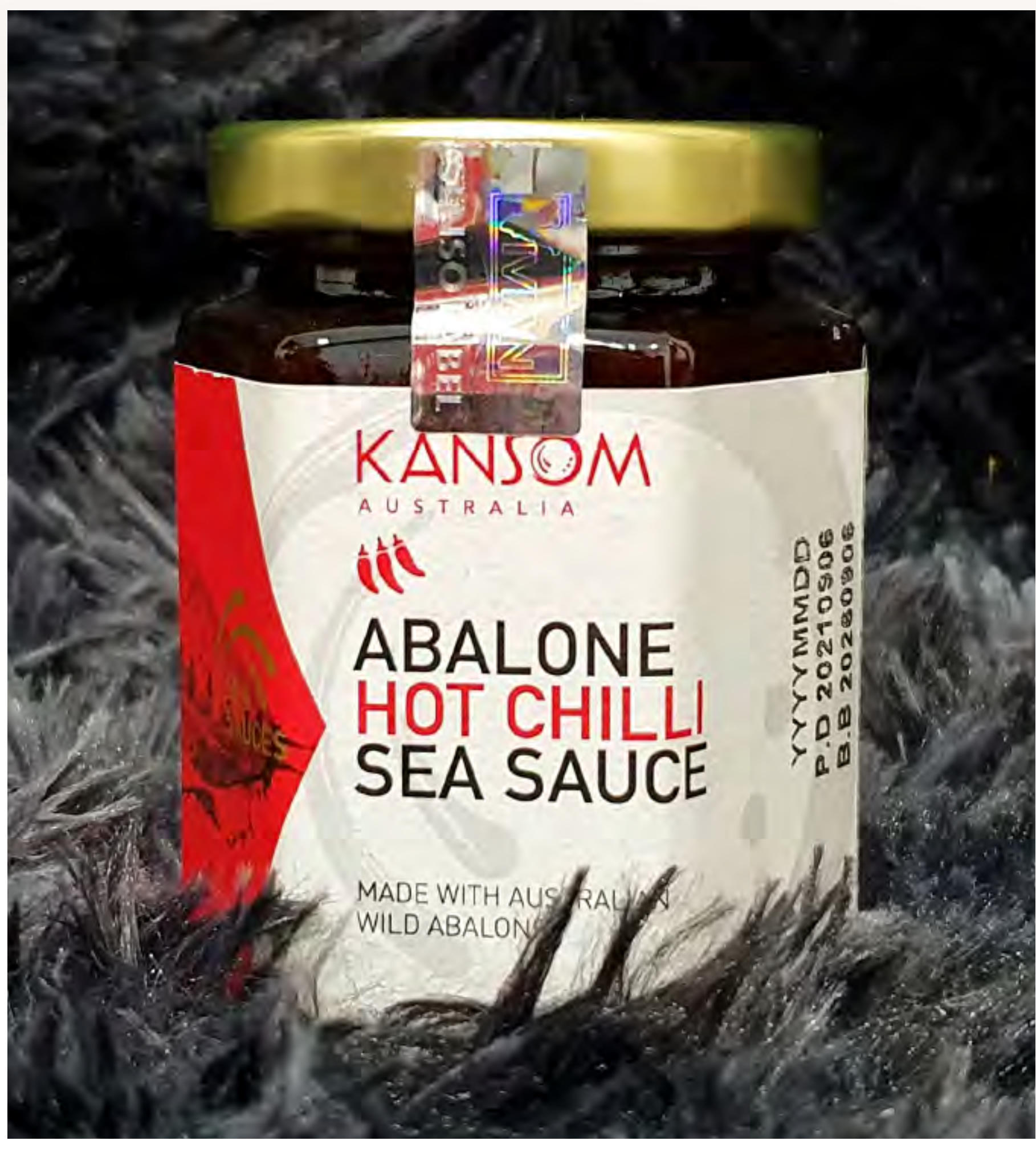
Our Abalone Hot Chilli Sea Sauce is perfectly balanced together. The perfect sauce for all those who enjoy the mouth watering and blazing taste of hot chilli.